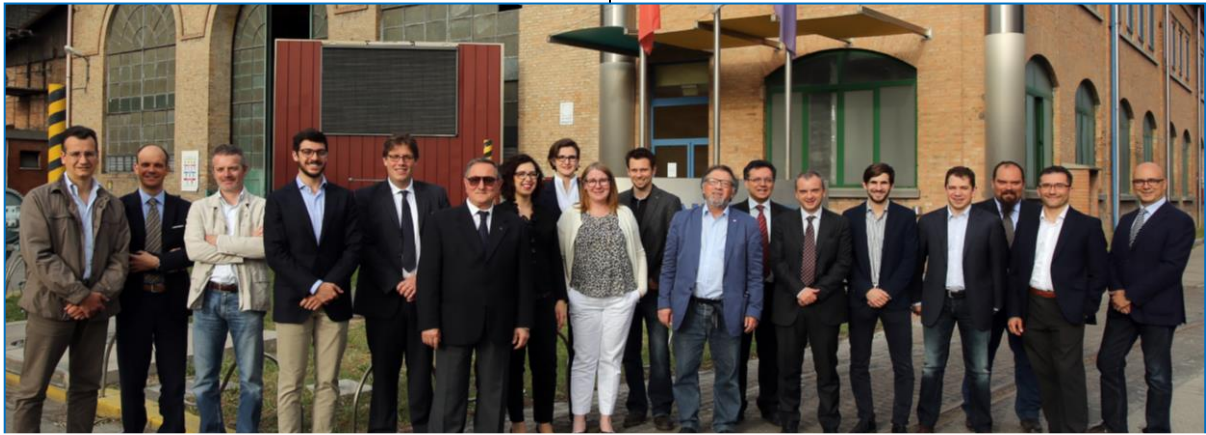
EUROSTEELMASTER, MAY 2015, TERNI (ITALY)